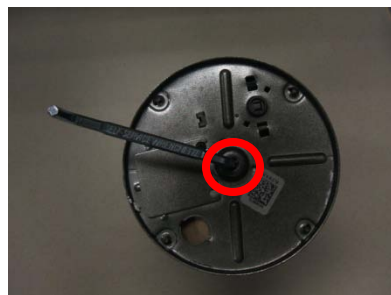
Wrenchette in Center Hole